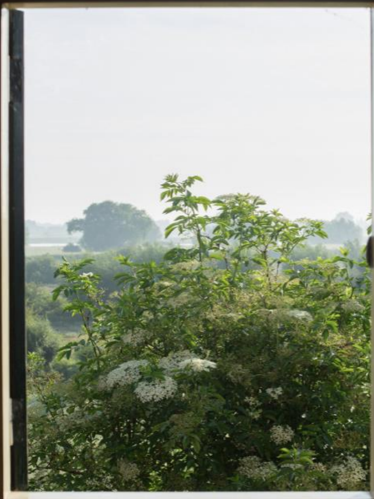
One shower a week