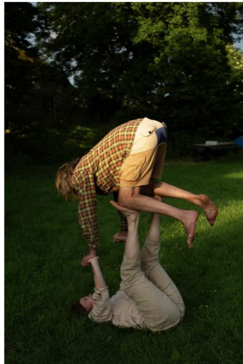
One shower a week